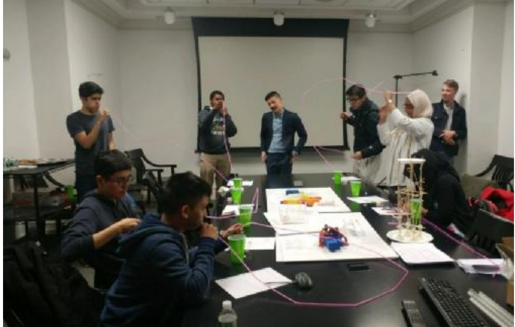
ASHRAE STEM Kit in ACE Mentoring Program at Kohler Ronan Engineers